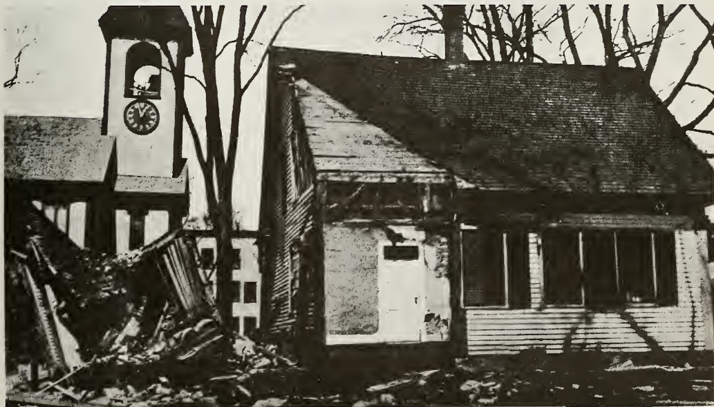
What was left of Bert Covell's house

Saturday morning, the Mohawk Valley looked as if a giant harrow had been dragged from the Balsams to Colebrook. Trees were plucked as though they were daisies, buildings were turned into matchwood, and the entire rubble of the flood has been dumped into town. Not a spear of grass showed anywhere along the path of the angry waters. Fifty-eight houses were damaged, of which 15 were completely demolished, 25 moved off their foundations, and forty-seven families lost their household goods. Several hundred feet of the Maine Central Railroad were washed out.