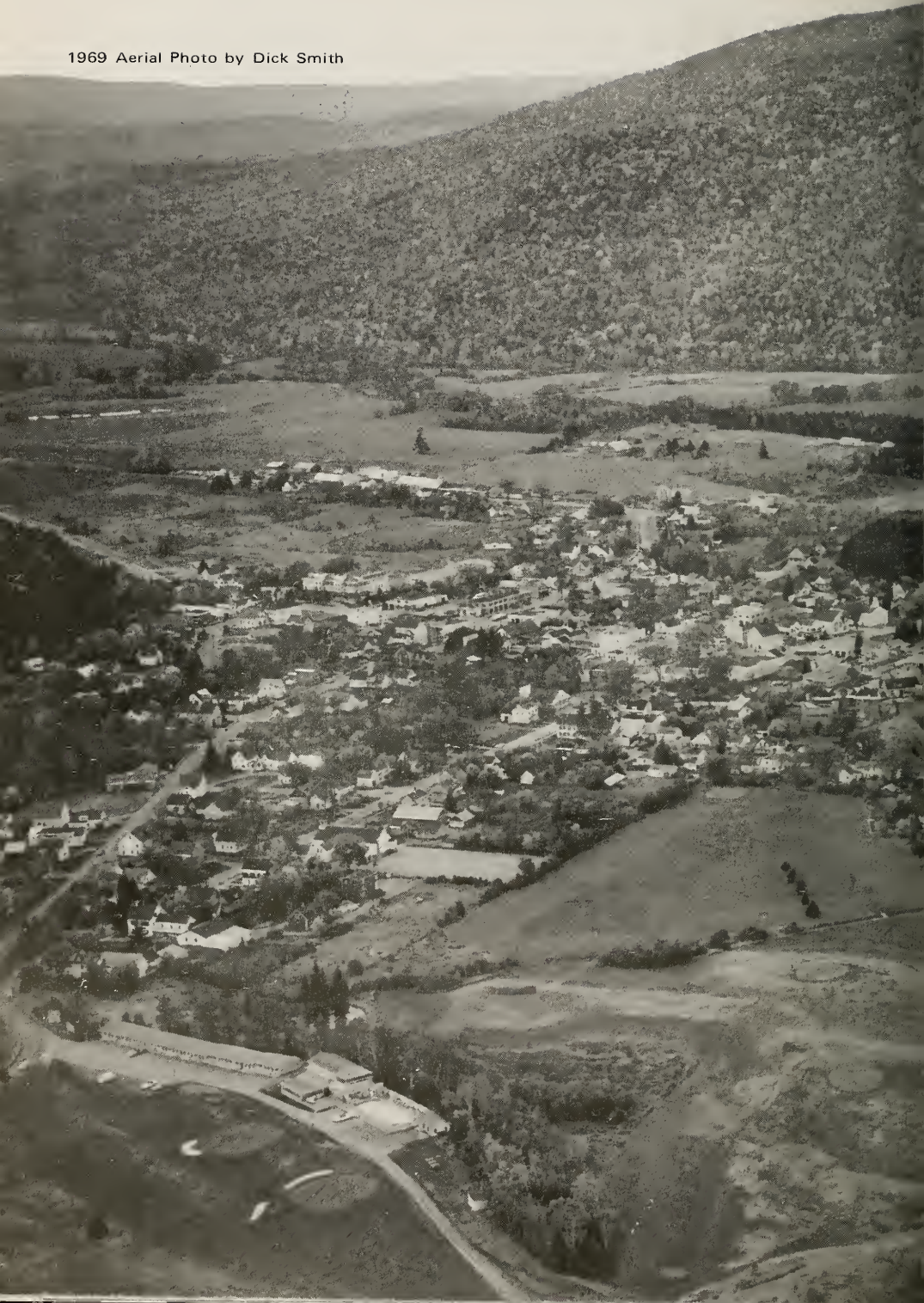
1969 Aerial Photo