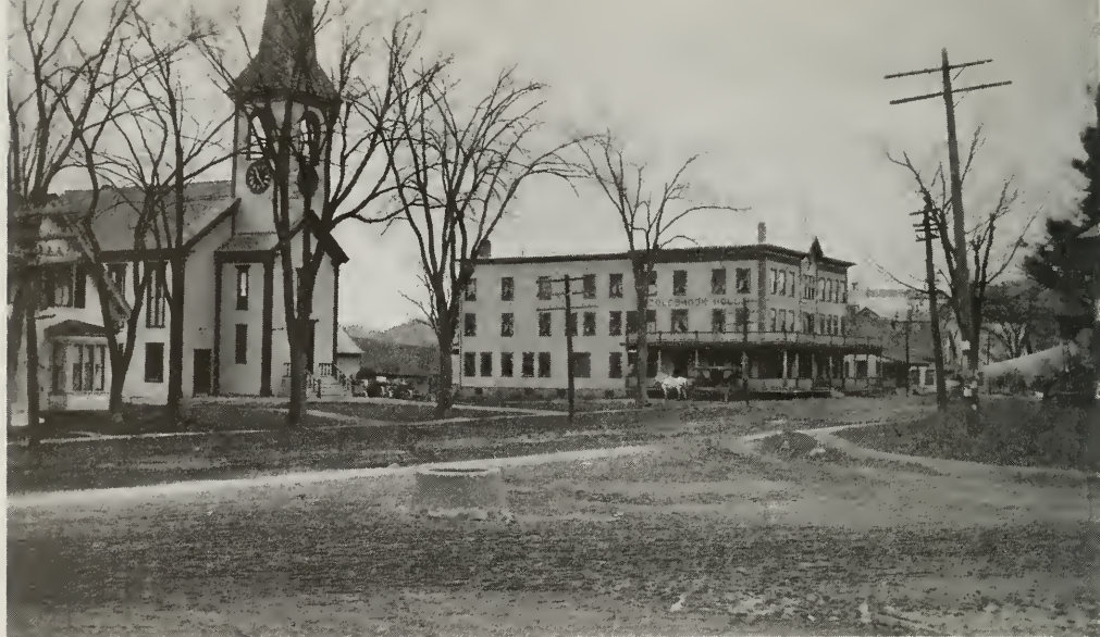
The Old Watering Trough at the Corner of Academy and Park Streets (Colebrook Academy dunked the Freshmen boys every year . . . and some upper classmen as well)