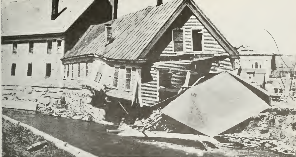
The "Pig's Ear" undermined