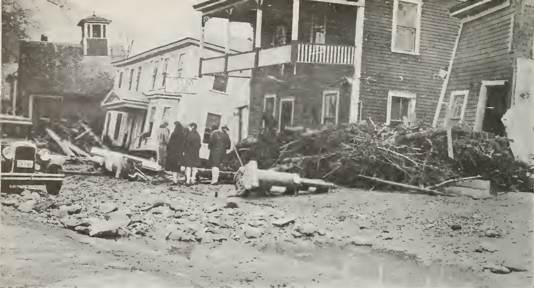
Everett Holden's gas business temporarily halted. Note gas pumps lying on ground