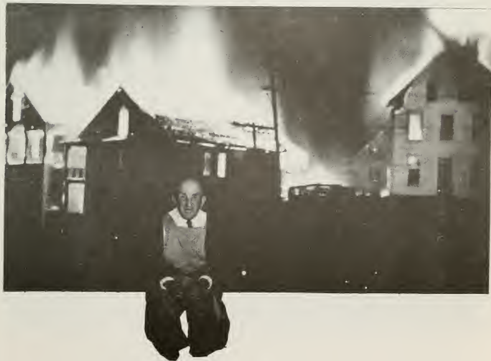
July 29, 1903 – The Forrestal Fire (Colebrook Grammar School (R) burns flat)