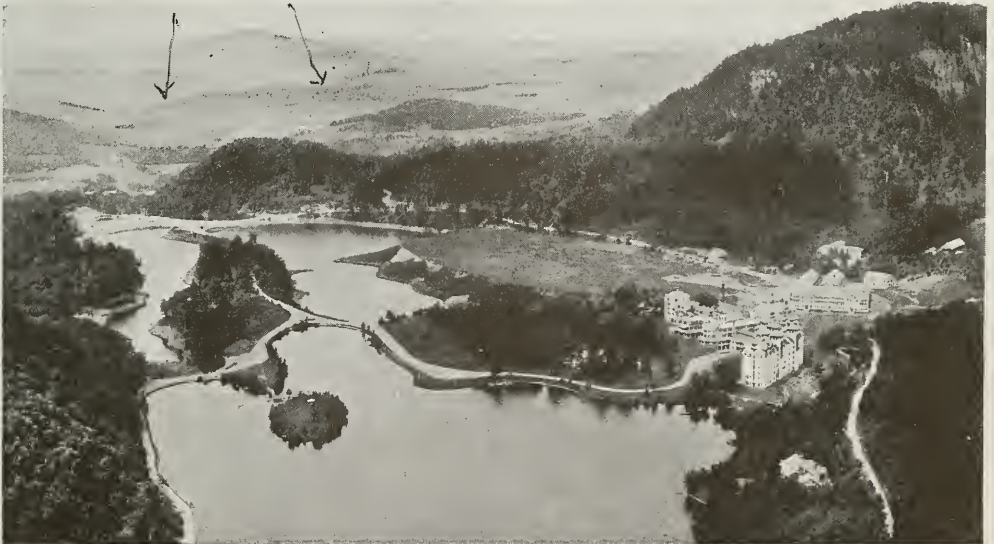
THE BALSAMS, LAKES GLORIETTE, ABENAKI AND COASHAUK, FROM MT. SANGUINARI