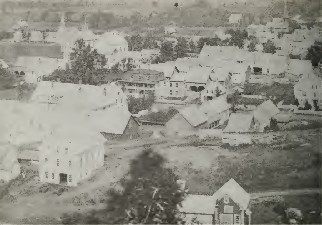
Colebrook after the fire of 1870 (Note the new Dudley Block — F & T today)