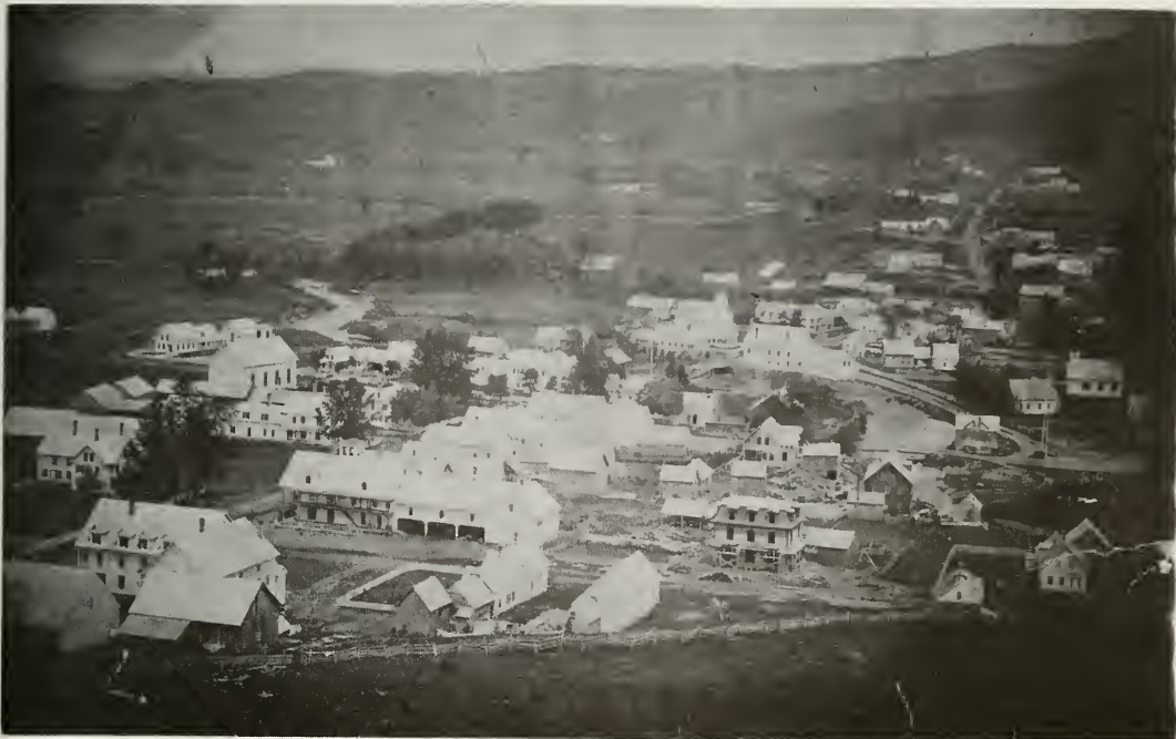
Colebrook before the fire of 1870 (Note Congregational Church steeple)