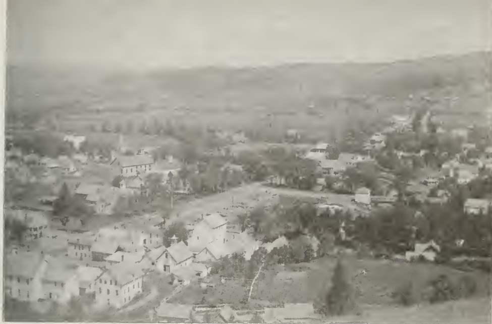
Colebrook after the fire of 1901 (Main Street leveled between Pleasant Street and Parsons Street)