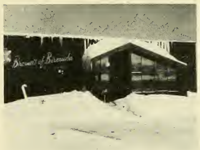
Brown's of Bermuda