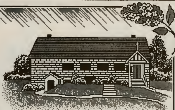
ST. STEPHEN'S EPISCOPAL CHURCH