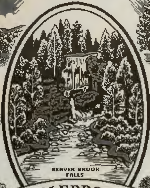
BEAVER BROOK FALLS