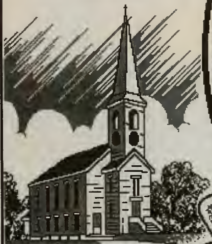
MONADNOCK CONGREGATIONAL CHURCH