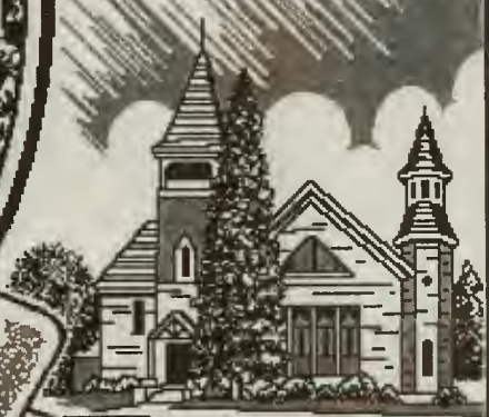
TRINITY UNITED METHODIST CHURCH