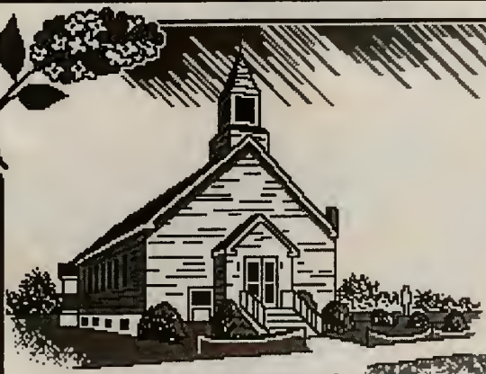
ST. BRENDAN'S CATHOLIC CHURCH